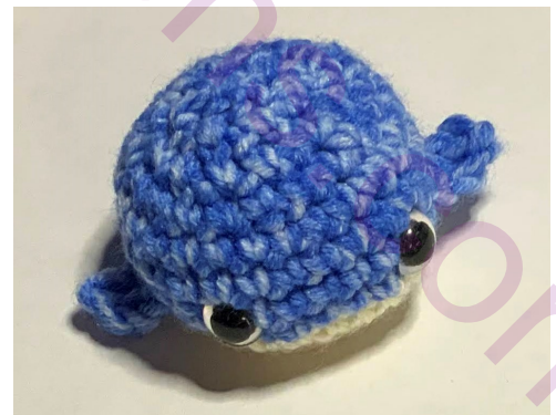
Ta Da! Finished Whale