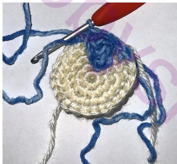
Attach Fin 1