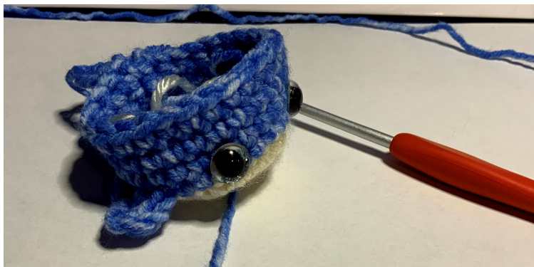
Eye Placement 2 st In From Fin